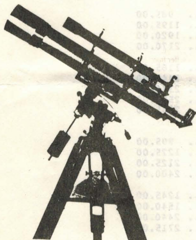
5.6"F7, mount, oak tripod, with 60mm guidescope

Super Nova Equatorial Head, as pictured above with one 6.4 lb. weight..... 495.00